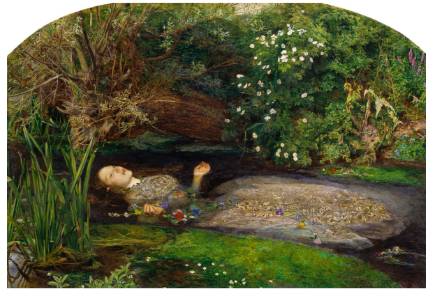
Ophelia (1851-2); oil on canvas, 30" x 44", by Sir John Everett Millais, Presented by Sir Henry Tate 1894