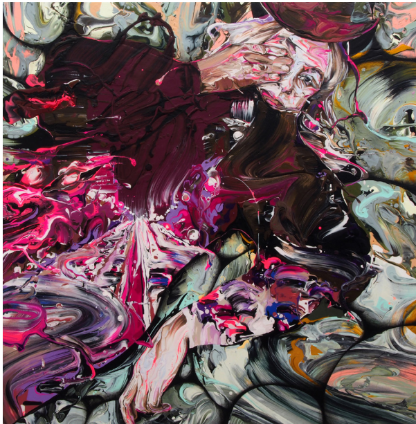
Transcription 80 (The Rambler) ; 31" x 31"

The Rambler is a crashing tidepool of ruby red, azalea pink, bloodied black. She or he (it is uncertain) covers one eye with the four fingers of their right hand, leaving only a half-gaze staring beyond. According to Sirpa, "it's okay if most of the characters can be seen in either gender: Androgyny has interested me since the beginning of my career." The left hand rests awkwardly atop what this writer interpreted as tide-smoothed stones on an ocean beach. According to the artist, they are "round stones left behind by the Ice Age at the top of a mountain in the wilderness." The mystery of the narratives in the paintings, and the artist's generous approach to interpretation, creates a complex and ultimately gratifying experience for the viewer.