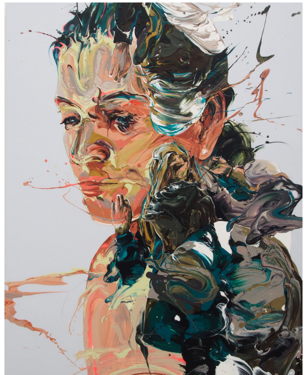
Transcription 79 (The Separated); 39" x 31"

The “human experience” is a complex physical and psychological state of being that Sirpa approaches by (re)presenting not one moment, but many. Her approach to time is “no longer linear”, but a layered experience allowing the viewer to experience several moments simultaneously. Each painting on view becomes a filmic experience; images that are layered and interlaced by the artist can be unraveled, interpreted, puzzled together and